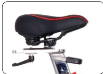
one simple touch for quick vertical setting

G.W.: 52kgs N.W.: 46kgs Packing: 1080 X 245 X 930 mm Loading QTY: 20'/40'/HQ: 118/246/270 pcs