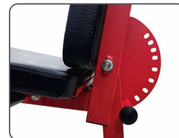
Backrest adjustment: 9 angles.